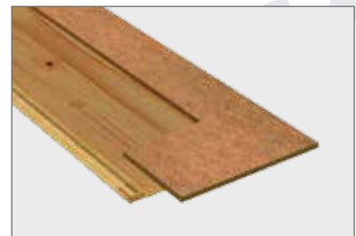
Under-structure with HDF board.

Length: 2200mm Width: 209mm m 2 /board: 0.46m 2 Boards/bundle: 4 m 2 /bundle: 1.84m 2 Bundles/pallet: 40 m 2 /pallet: 73.60m 2 Weight/pallet: 793.60 kg