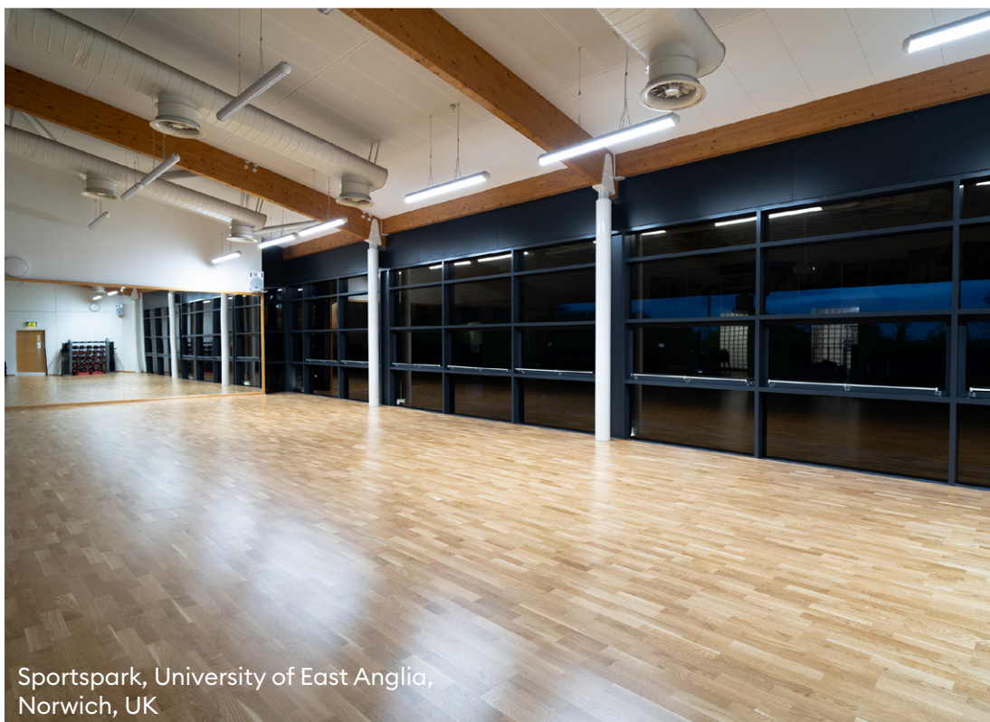
Sportspark, University of East Anglia, Norwich, UK